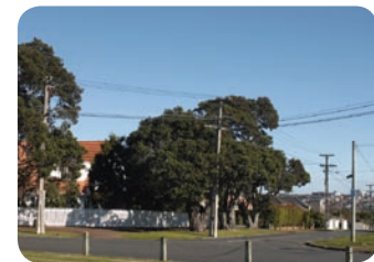
Fenton St, Orakei, before and after undergrounding.

So far, over 124 kilometres of power lines and poles have disappeared from streets all over Auckland, Manukau and Papakura thanks to this project. Undergrounding power lines within the Trust area is a big job and it's going to take a long time. Take a look at the "before and after" photos at aect.co.nz to see the difference it's made to a bunch of neighbourhoods already.