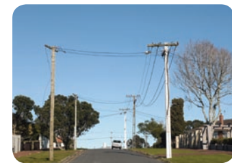
Titai St, Orakei, before and after undergrounding.